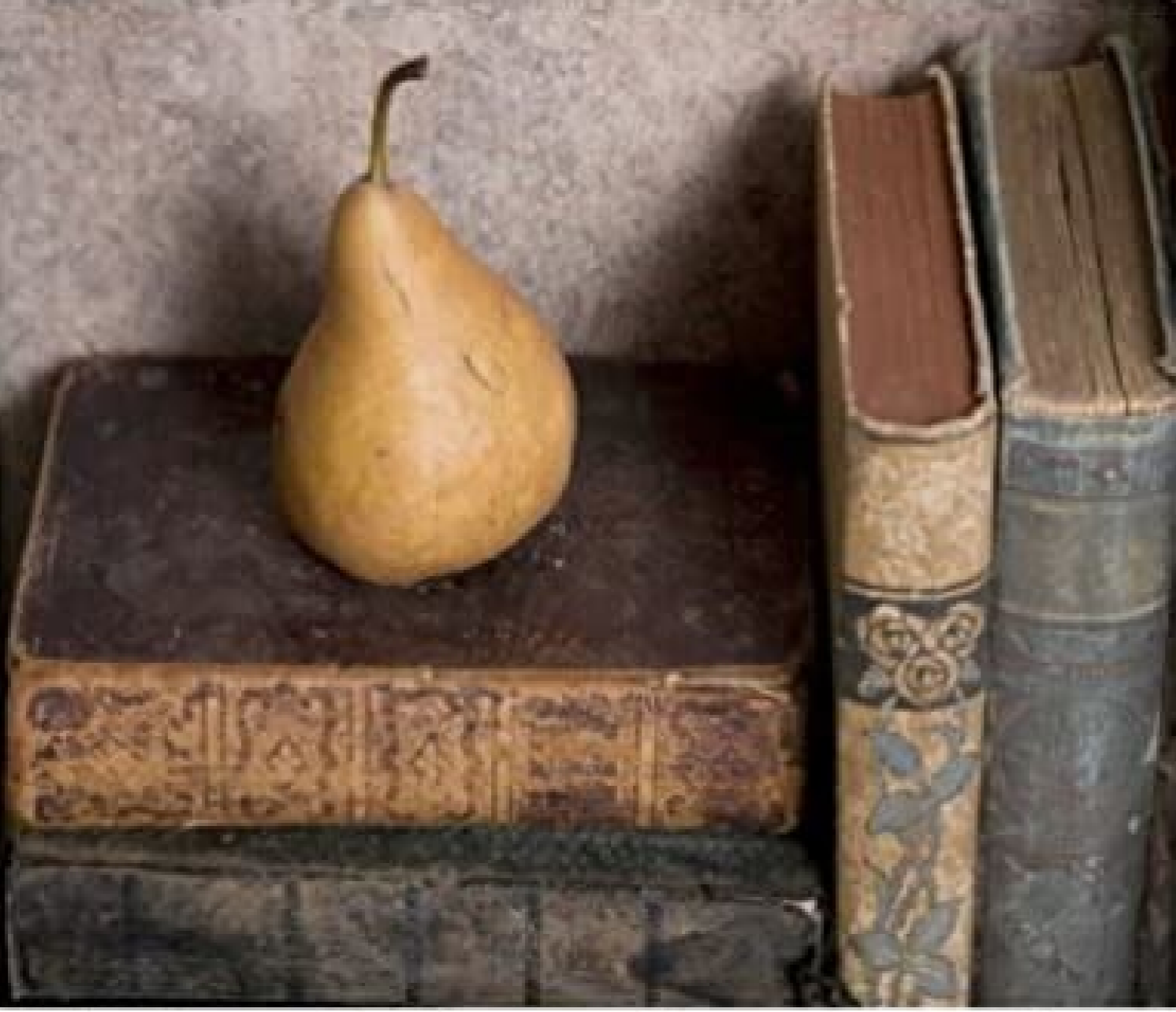
THE PLAYS OF WILLIAM SHAKSPEARE: WITH THE CORRECTIONS AND ILLUSTRATIONS OF VARIOUS COMMENTATORS, TO WHICH ARE ADDED NOTES, VOLUME 10... WILLIAM SHAKESPEARE, GEORGE STEEVENS, SAMUEL JOHNSON, ISAAC REED